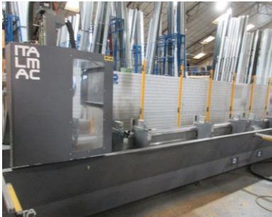
Italmac Spring 7000 4AX CNC profile machining centre (2020)