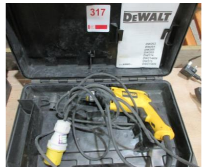
Selection of hand tools