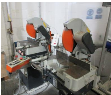
Elumatec twin head mitre saw, type DG 79/30