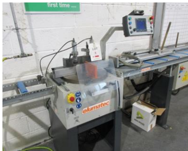
Elumatec TS161/21 bead saw (4off)