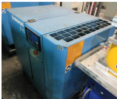
Boge S15 packaged air compressor