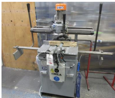
MLA A24 copy Router