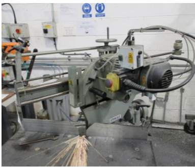
Graule ZS 170N radial arm mitre saw