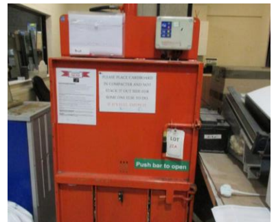
CK International CK51 cardboard compactor