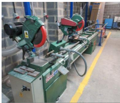
STB SD15/S double mitre saw