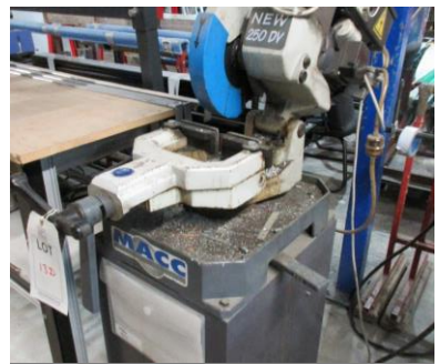
Antiference chop saw, model New 250DV