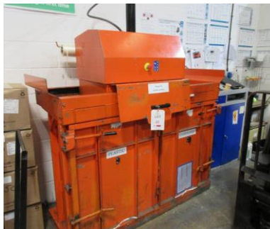
CK International CK25D twin cardboard compactor