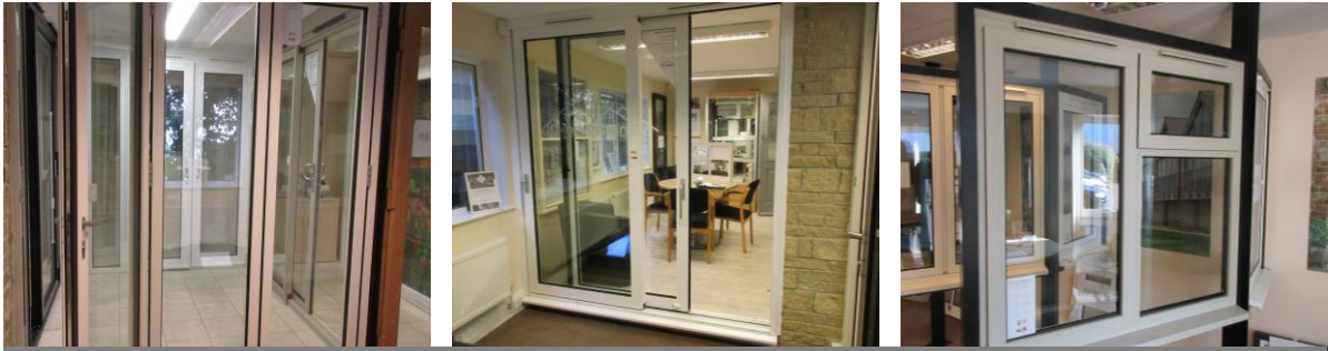
Showroom Aluminium frame bi-fold doors, patio doors and window