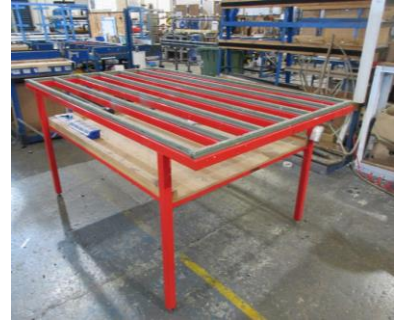
Racking and Assembly benches