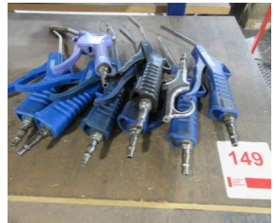
Pneumatic hand tools