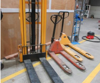
Hydraulic pallet trucks