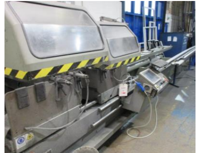
Emmegi Twin Electra SUN TU/5 double mitre saw