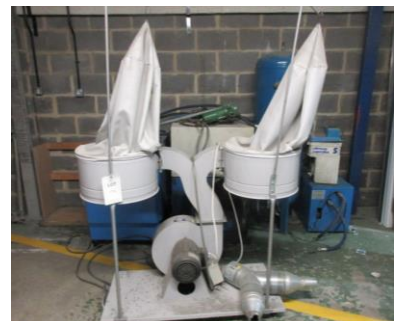
Europane mobile twin bag dust extractor, model EP702B