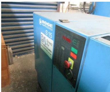
Boge Ratiotronic S15 packaged air compressor