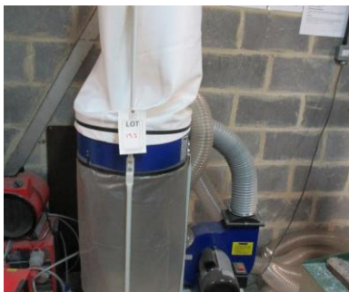
Charnwood mobile single bag extractor