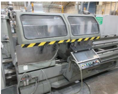
Emmegi twin Electra SUN TU/6 CNC double mitre saw (door saw)