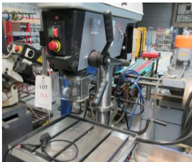
Professional AP540PD pillar drill (2022)