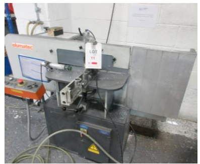
Elumatec AF233/60 end miller