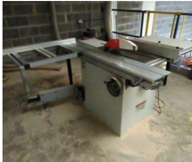
Axminster Trade Series MJ12- 1600MK11 panel saw