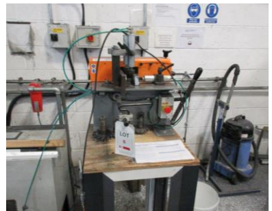
Antiference M7GOR45 end miller