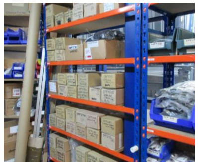
Large selection of consumable stock