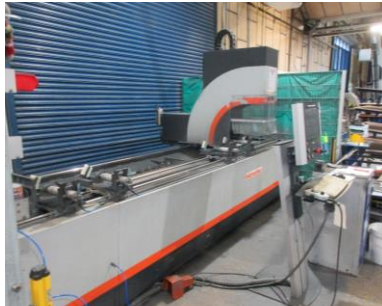
Elumatic SBZ 122/23 CNC profile machining centre