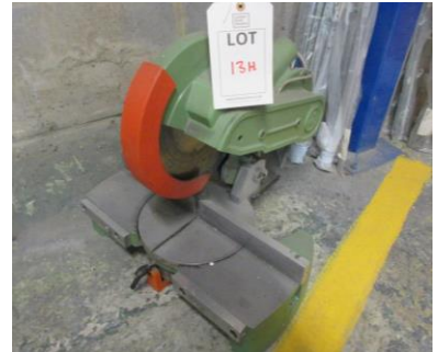
Mitre chop saw